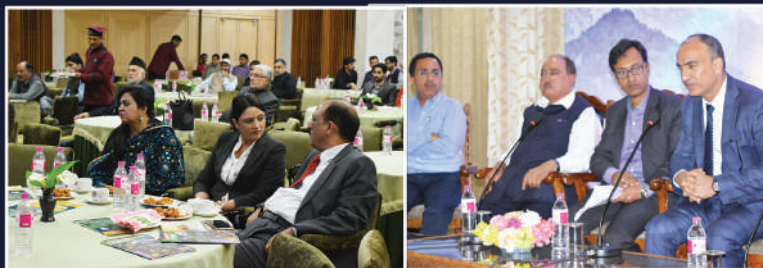
May 14, 2016 Kashmir Calling | SKICC, Srinagar